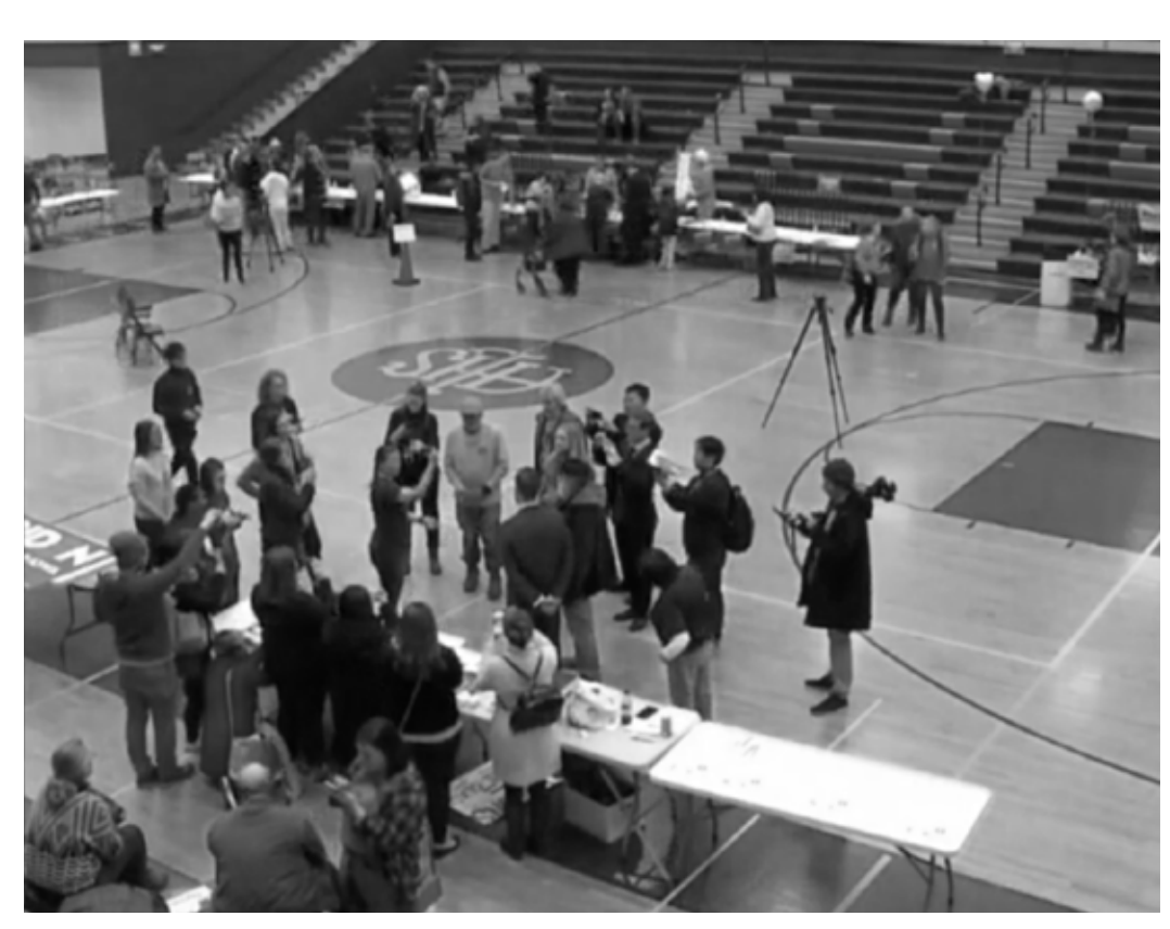
Coin toss decides Iowa caucus winner.

caucus often assume it's an ancient Iowan custom, in other words, a tradition, whose quaintness we've outgrown, kind of like the ritual in Shirley Jackson's famous short story "The Lottery." In "The Lottery," of course, a crowd of villagers assemble to stone to death an unlucky citizen, for the community's continued well-being and agricultural success. I repeatedly taught this story in Iowa to undergraduates. It was a crowd favorite.