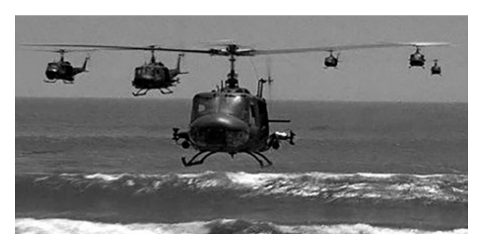
Still from Apocalypse Now: the Final Cut.

I remember when I was with Special Forces. Seems a thousand centuries ago. We went into a camp to inoculate some children. We'd left the camp after we had inoculated the children for polio. And this old man came