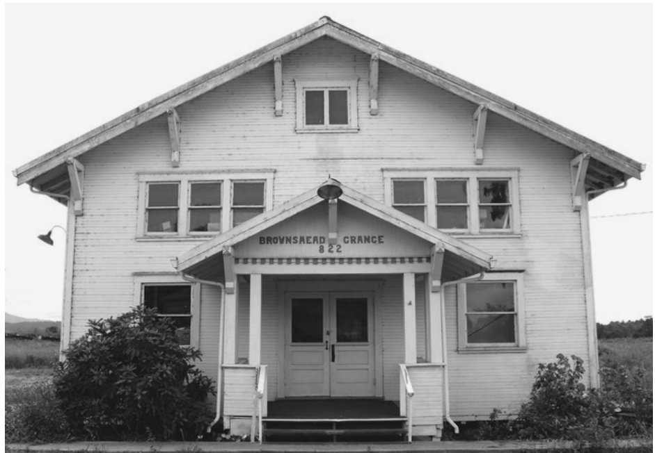
Grange Hall, Brownsmead, Oregon.

“Mighty farmer, labor, and women’s rights movements undertaken in the