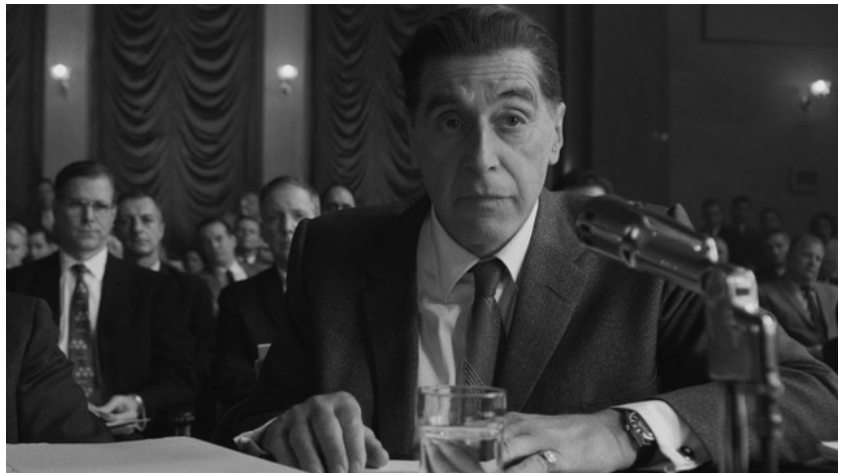
Al Pacino as Jimmy Hoffa in The Irishman (Netflix).

And the Teamsters knew this wasn't an empty threat. Also, rumor had it that part of that deal included the feds promising