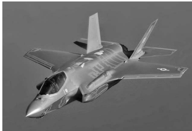
F-35 in flight.

Q: Would the Air Force ever add hardware to the F-35As in