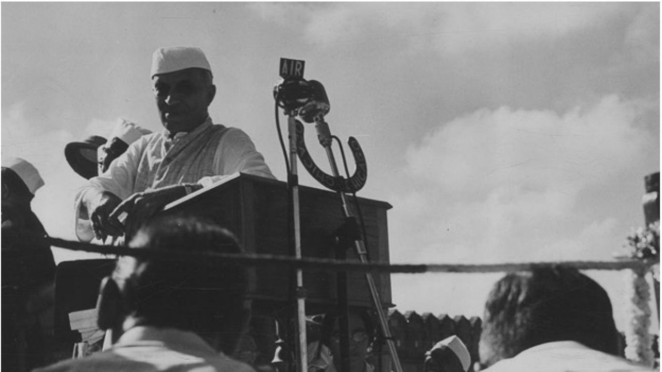
Nehru speaking at the Red Fort, Delhi.

its (modern-day East India) corporations are in the process of 'developing' India by again helping themselves to the country's public wealth and natural assets (outlined further on).