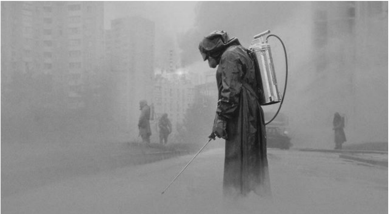
Still from Chernobyl (HBO).

a story of conflict between the two scientists and a bureaucracy that was acting in the time-dishonored Soviet tradition of lies and secrets. Between the secondary characters like the plant managers who tried to cover up their misdeeds and the two scientists, Scherbina is a man poised on the knife's edge. Trained as a loyal Soviet official, his first instinct is to accede to the demands of fellow bureaucrats to treat Chernobyl as a containable local problem but as the horrors mount, he moves inexorably toward the realization that Chernobyl was a product