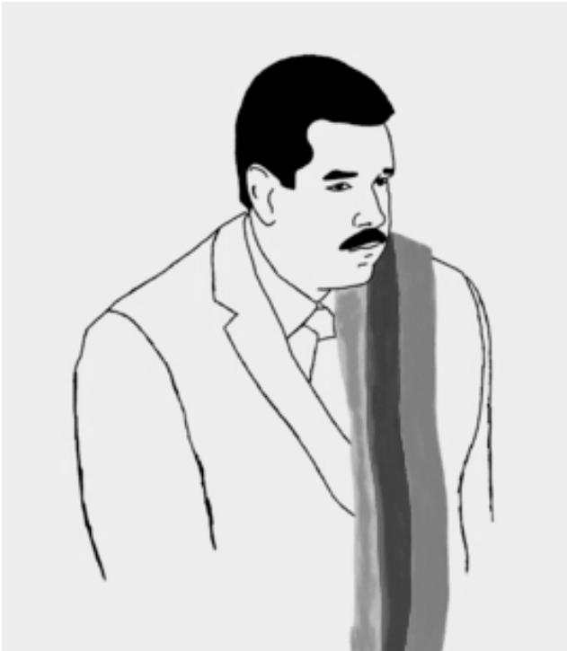
Nicolas Maduro.

was a year of important electoral races in Venezuela, the NED 'electoral' funding went to organizations focusing on projects including, "Get Out the Vote" campaigns, electoral observation networks, working with Venezuela's "democratic actors," training of candidates and more. The largest funded project, as shown in the declassified documents, received $135,000 for an electoral observation network and a more efficient "Get Out the Vote" campaign. In the 2013 Annual Report, one project received $149,413 to "foster entrepreneurship in Defense of Democracy and Free Markets," and another $295,050 for "Improved training and communication skills for political