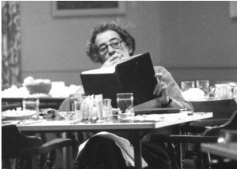
Hannah Arendt.

One of the characteristics of so-called totalitarian regimes is a collection of things, such as gulags, that are in plain sight but that no one dares to mention. That everyone so easily takes leave of his senses because he is afraid of being frowned upon reveals a pathetic slavish population, banal if you will, not some diabolically evil regime. No one makes us do this. We do it because we are afraid of losing our jobs. Apparently, we care nothing for losing our marbles. But we are going to die soon anyway, so what are we thinking? Nothing, in Arendt's