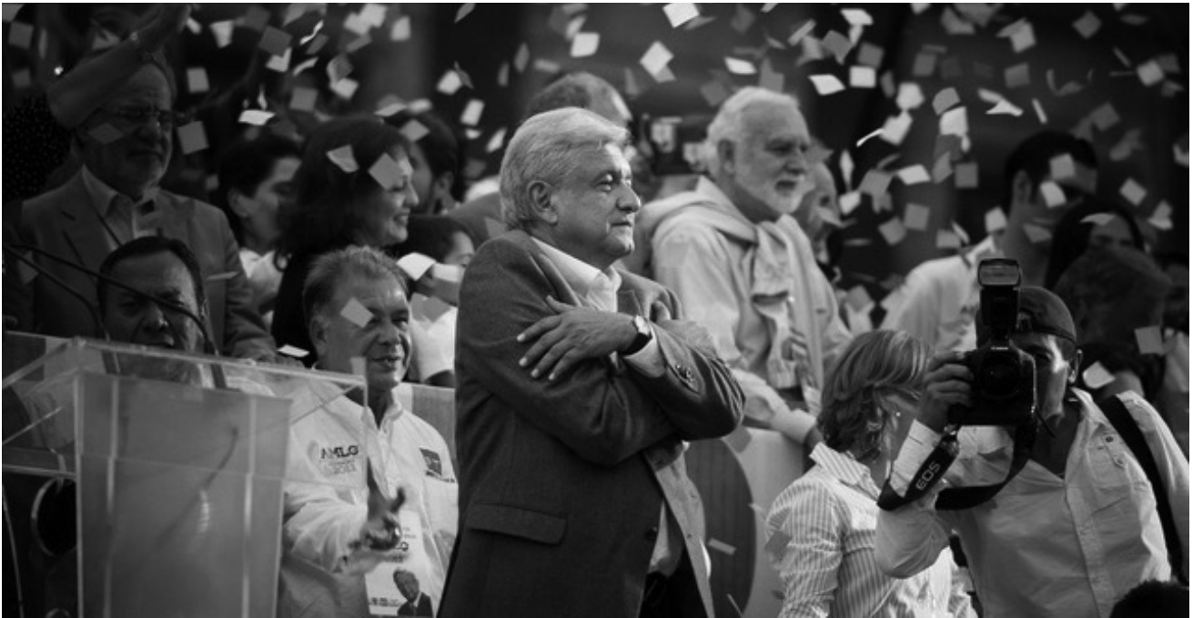
Lopez Obrador at the Zocalo.