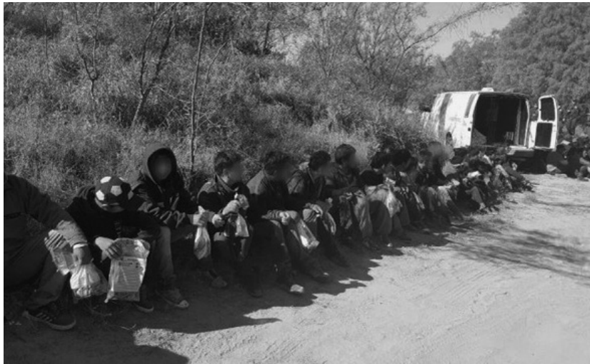
Immigrants detained by ICE in the Rio Grande Valley.

To stop that from happening again, we have to keep our bearings. Children shouldn’t be separated from their parents, and families should not be held in prisons for seeking a safe place to raise their children. CP