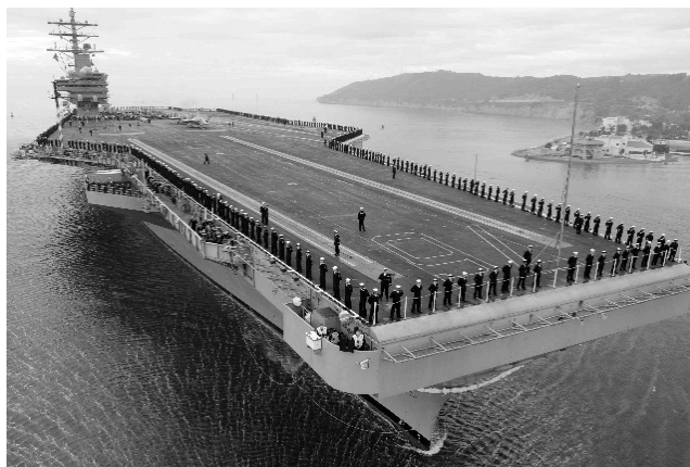
USS Ronald Reagan.

Clearly, decontamination was not quick or easy. According to sailors who served on the Ronald Reagan, it was barred from ports in Japan and South Korea because of the radioactivity issue and sailed the Pacific, Flying Dutchman fashion, until the ship had been cleaned up. In calculating theoretical radiation doses for the Reagan, the U.S. Navy’s worst case