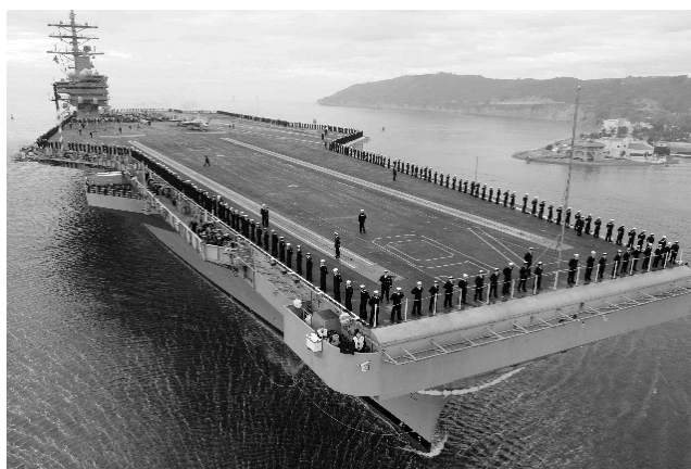
USS Ronald Reagan.

Clearly, decontamination was not quick or easy. According to sailors who served on the Ronald Reagan, it was barred from ports in Japan and South Korea because of the radioactivity issue and sailed the Pacific, Flying Dutchman fashion, until the ship had been cleaned up. In calculating theoretical radiation doses for the Reagan, the U.S. Navy’s worst case