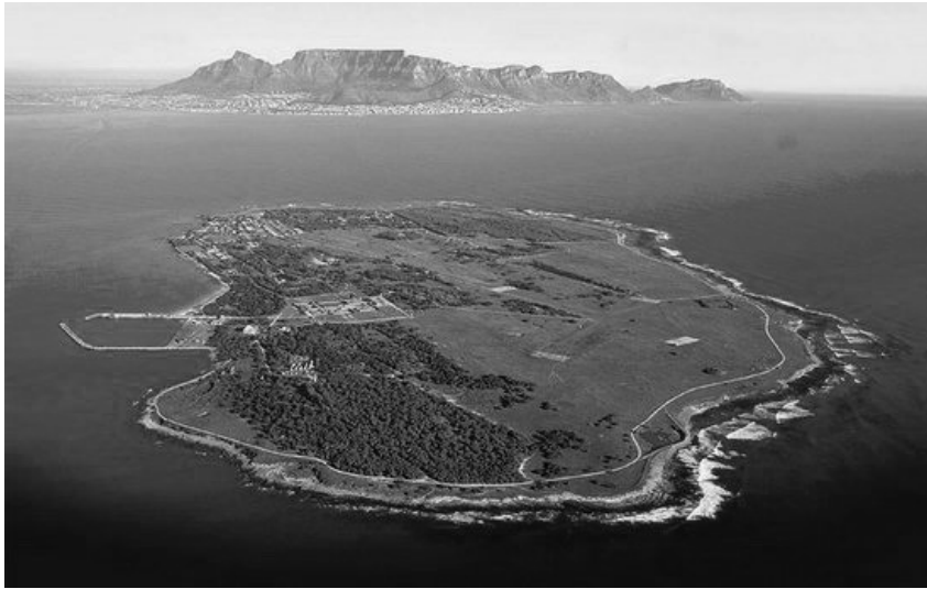
ROBBEN ISLAND PRISON, SOUTH AFRICA.