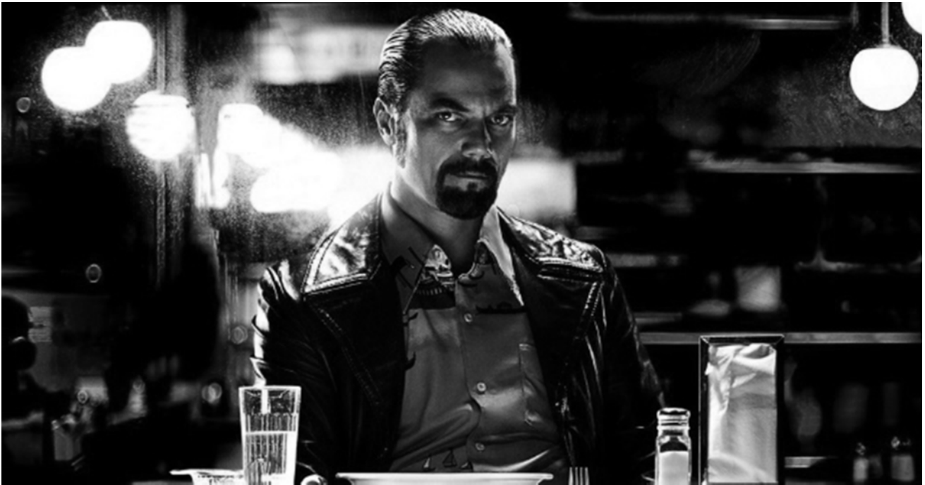
Michael Shannon in The Iceman .

dren from their mothers and plucking these magnificent creatures from their “homes” only to imprison them in undersized containers. Sea World is not far removed from the Arena in the Hunger Games . When the film’s tragic protagonist Tilikum kills his trainers, consider it revolt against a system in which monetary profit trumps moral decency. To quote the Hunger Games : “Remember who the enemy is.”