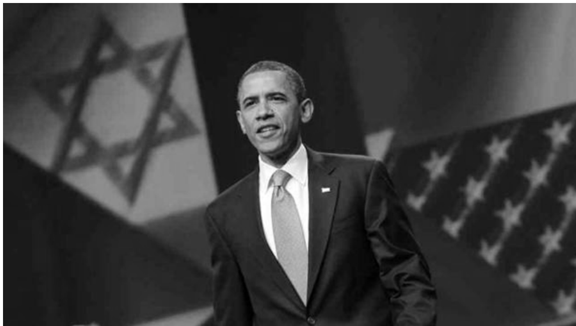
Obama at AIPAC convention.

Within two weeks, it was able to get 76 senators, from both sides of the aisle, to sign a letter reminding Ford that