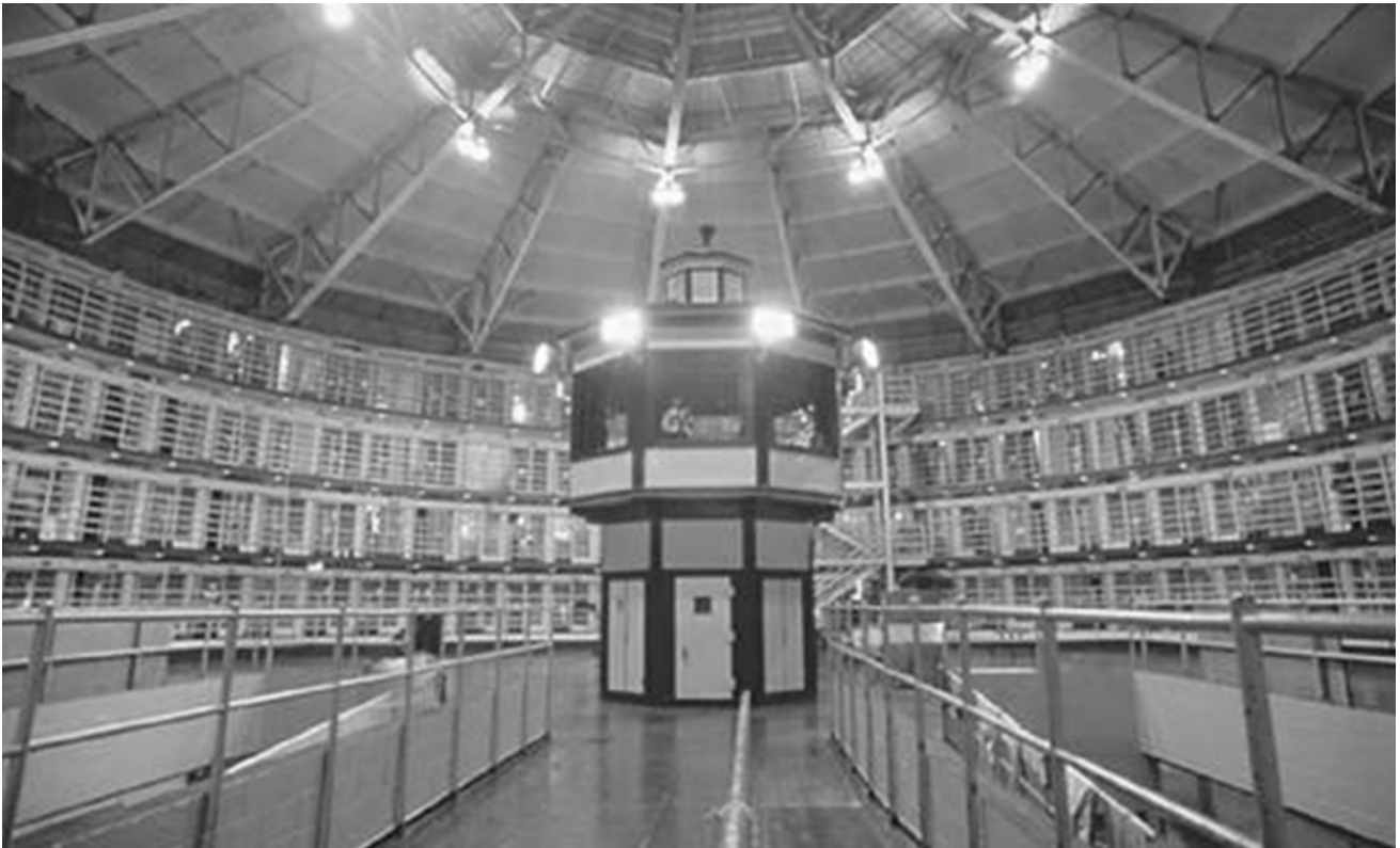
The modern Panopticon: Florence, Colorado Federal Prison.

Funding for various law enforcement drug task forces began to dwindle during President Bush's tenure, but presidential candidate Barack Obama promised to revive the Byrne grant program, claiming that it is "critical to creating the anti-drug task forces our communities need." Following the election, Obama allocated $2 billion in new funding for the Byrne grant program despite its abysmal failure to do anything other than lock up casual drug users and smalltime dealers.