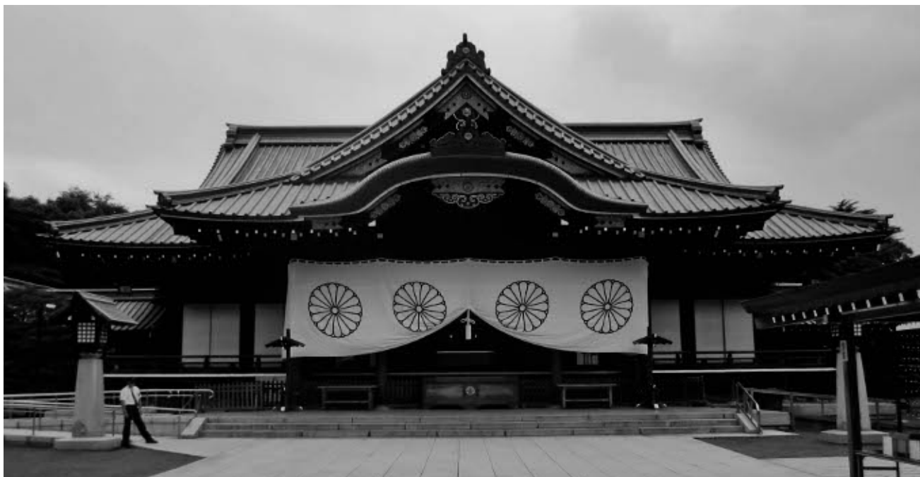
Yasukuni Shrine.