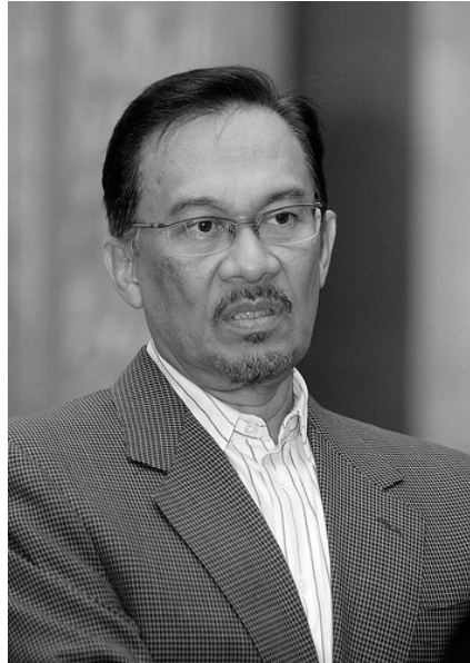
Anwar Ibrahim.

During the Asian financial crisis in 1997, Anwar implemented IMF austerity policies, including cutting government expenditures by 20 per cent, stripping funding from Mahathir's enormous infrastructure projects that promised to bring Malaysia into the 21st century — a move that dismayed Mahathir and hastened Anwar's departure from government, which happened dramatically in 1998. In the end, Mahathir rejected the IMF's medicine and took credit