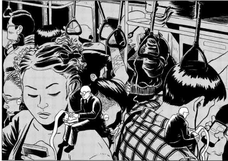
Illustration by Ian MacEwan.

The 1934 Communications Act federally criminalized the tapping of telephones, and in 1939 Nardone v. the US , the Supreme Court upheld Congress's ability to federally outlaw the use of wiretaps. Yet the FBI and other law enforcement agencies continued illegal wiretap operations, gathering information not presented in court. But Nardone stopped short