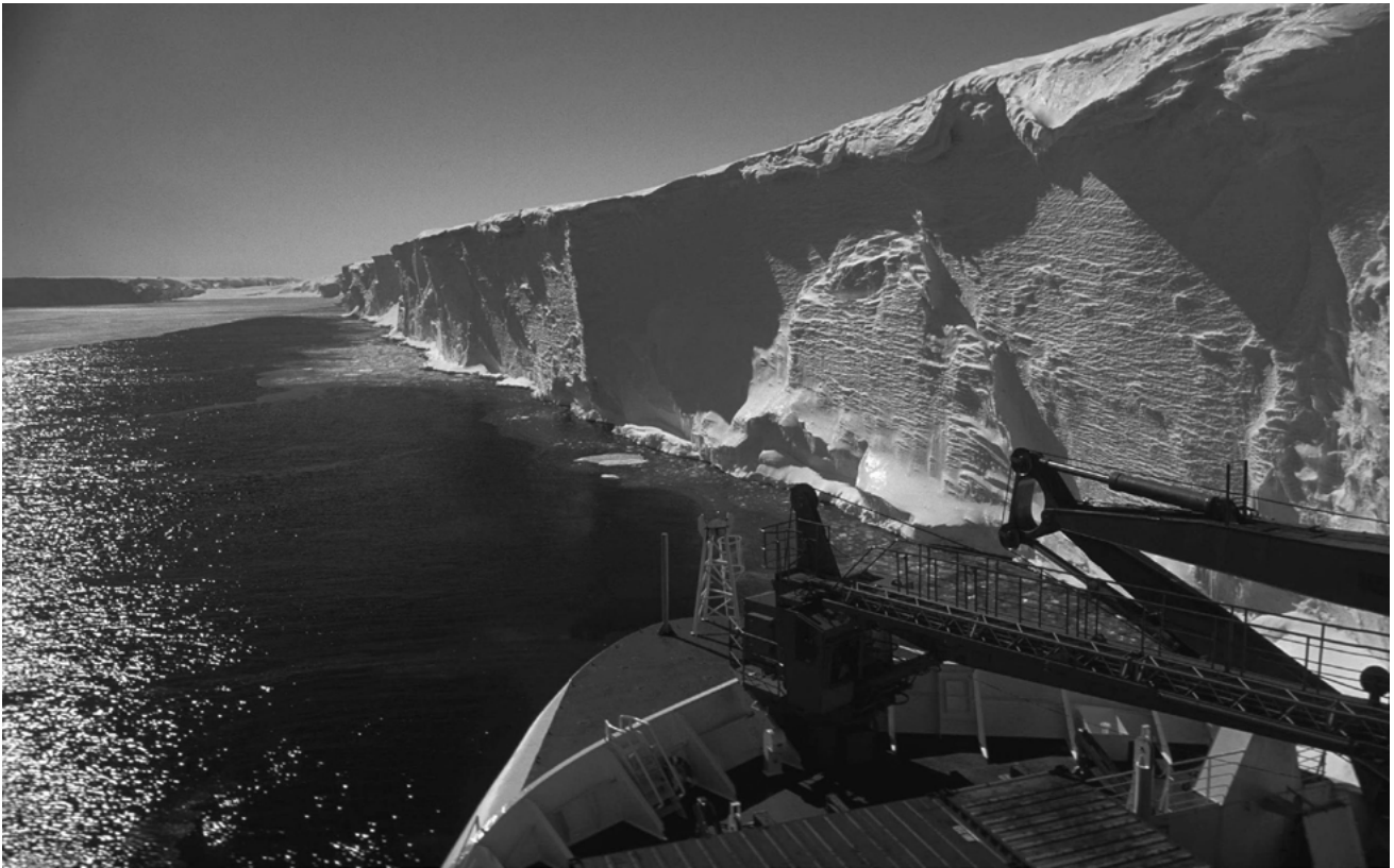
Edge of Ekstrom Ice Shelf, Antarctica.

rooting out of dissent beginning with Lenin in the name of defending the revolution from exterior perils (if you think for yourself the Tsarist reaction wins) might also be considered fertile soil for his rise to power and the terror that followed. In each instance the playing of the victim associated with the construction of the mythology of an external threat, be it enemies of the nation, tsarists and capitalists or terrorists, blaming of the victim by associated dissenters and others in the way as agents of the constructed threat, and the 'if you think for yourself the evildoers win' logic characteristic of moral disengagement, the collective term understood in social psychology for mechanisms of blame-shifting.