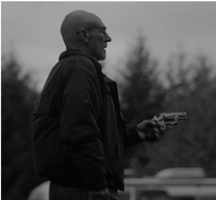
Still from Green Room .

All of this is to say that while the Academy seemed to luck out with this year's fake-out Best Picture, and the ensuing press shining even more light on Moonlight's win, it may be a short-lived victory. They have put a band-aid on a gaping wound that can't be fixed with PR stunts and token nominations.