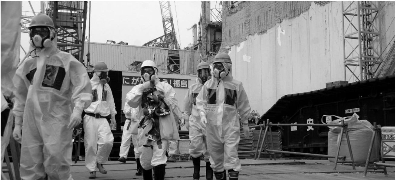
IAEA inspectors visit Fukushima nuclear plant.

that radiation was limited to official exclusion zones, chose to leave their homes. Many families reported suffering health problems beyond the officially contaminated area, including nose bleeds and nausea.