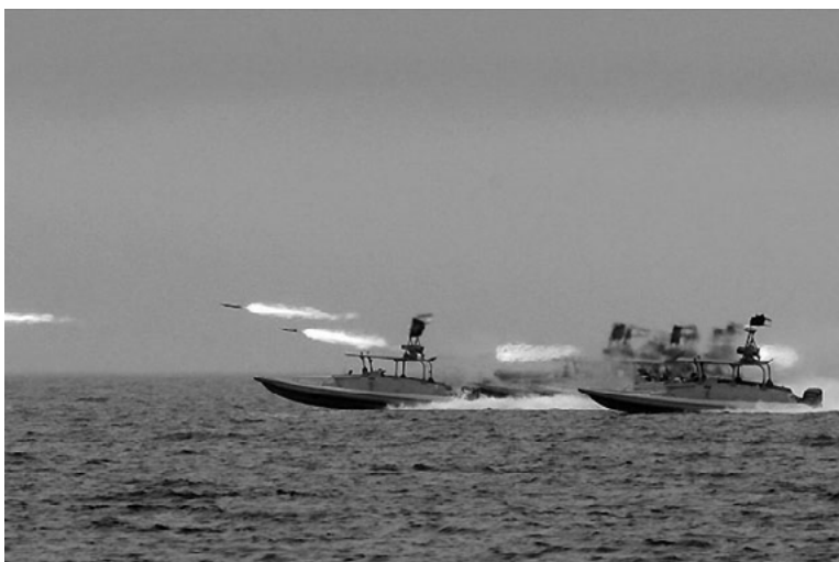
Naval exercises by Iranian Republican Guard.

Herein lies the purpose of the much-touted ‘Trump-Putin deal’ that is supposedly in the pipeline. Trump and co know very well that Russian acquiescence will be