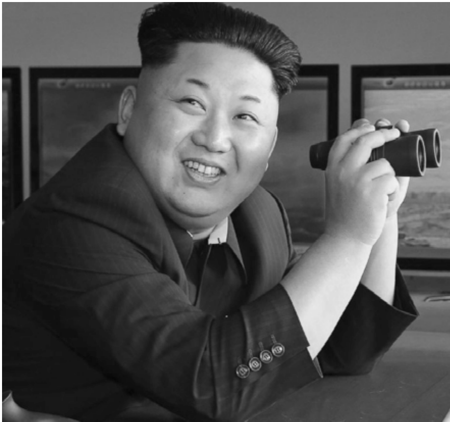
KIM JUNG UN

With little international support and politically hammered by a pasting in the November 2006 mid-term elections,