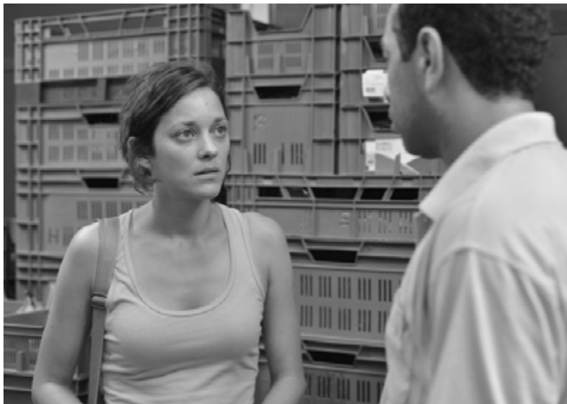
STILL FROM "TWO DAYS, ONE NIGHT."

the tiniest bit of spot color or glimpse of a bit of sunlight or grass—is intentional. Spot color pops up in the most unlikely places giving us an improbable source of visual relief: an orange garbage can, a blue mailbox, a potted plant in the corner of an otherwise dreary apartment. The smallest act,