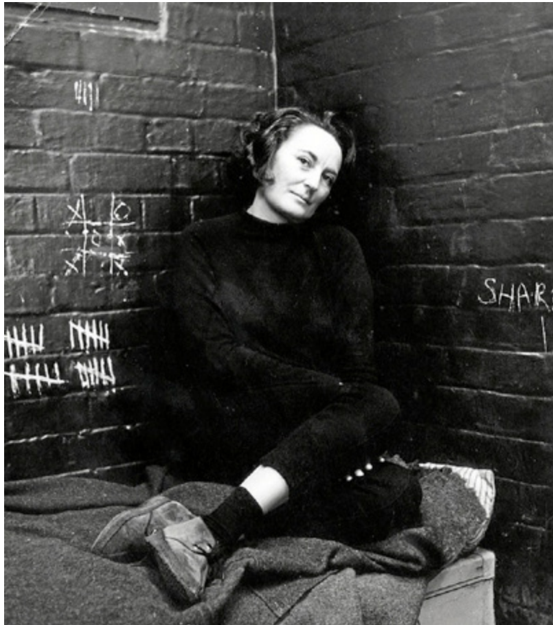
RUTH FIRST IN PRISON.

were effectively a form of modern slavery, his concerns that her anti-racist views could damage the American status quo. Another SECRET FBI memo from this period had the subject headings: "RUTH FIRST, aka: Mrs. RUTH SLOVO, POLICE COOPERATION, FOREIGN MISCELLANEOUS" and included inquiries pertaining to someone [redacted] linked to the Press Trust of India, apparently living in New York City, and an American economist known to her who had taught in Russia; both of whom had links to Ruth First.