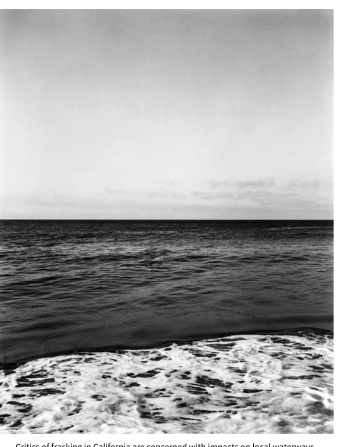
Critics of fracking in California are concerned with impacts on local waterways, especially in coastal areas such as those in Monterey County.

What all of this means is clear: California is in the throes of a fight for its economic and environmental future. Fracking opponents aren't buying the industry's job creation arguments. They also believe a further degraded environment