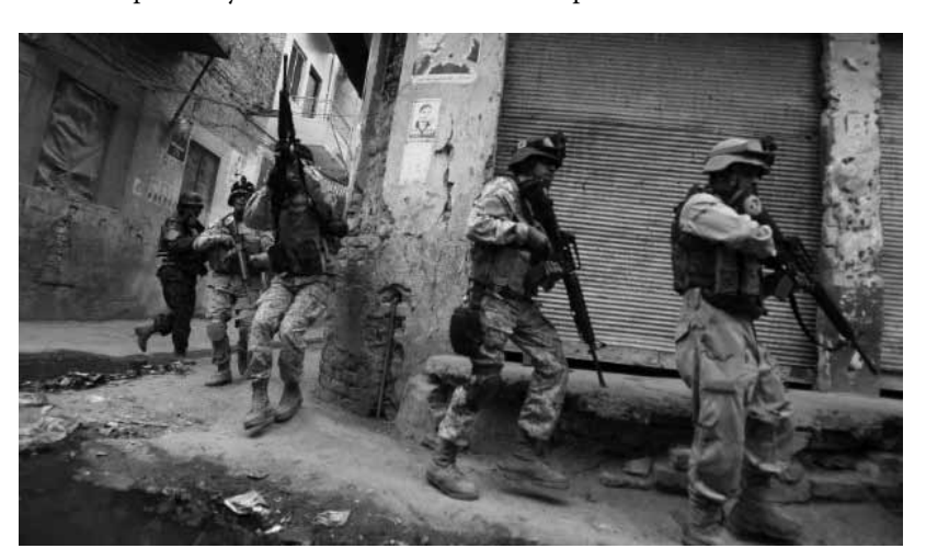
US troops during a raid in Fallujah.

mostly Special Forces, worked with each Iraqi unit. These teams were in roundthe-clock communication with their CIA bosses via the Special Police Command Center, and there is no record of the Special Police ever conducting operations without US supervision, even as they massacred tens of thousands of people.