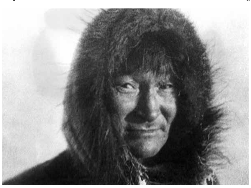
Film Still from Nanook of the North

the UK was concerned with furs and instant wealth. The original banalities of the original investors (aristocracy) couldn't see the usefulness of Canada as a land, what they wanted was trading posts to supply the wealth from the north. The different clergy came along too, hanging on the coat-tails of mighty in order to establish their own bridgehead.